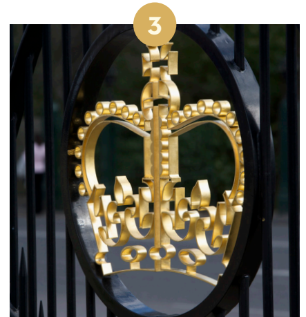
S O V E R E I G N ' S G A T E