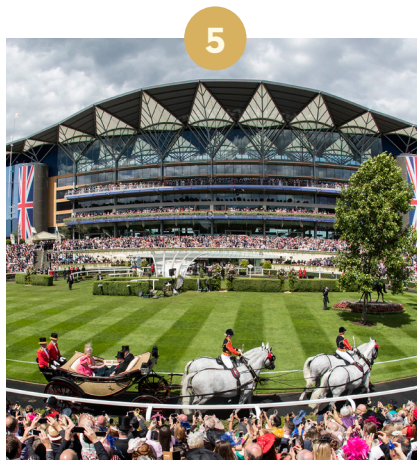
G R A N D S T A N D