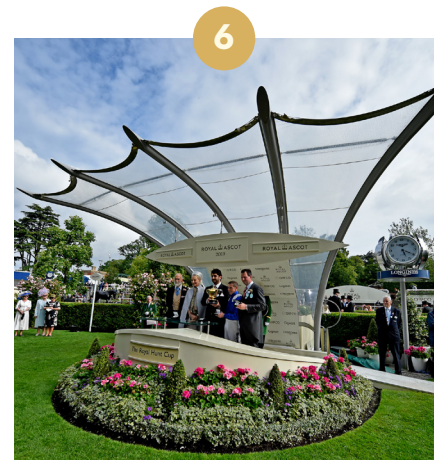
P O D I U M