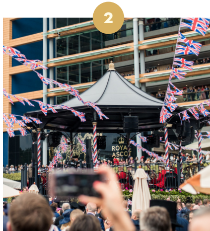
B A N D S T A N D